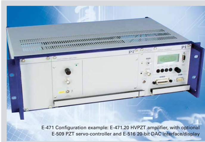
E-471 Configuration example: E-471.20 HVPZT amplifier, with optional E-509 PZT servo-controller and E-516 20-bit DAC interface/display